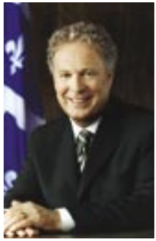
Keynote Speaker Premier Jean Charest

Monday, October 31 st , 2005 Marriott Château Champlain 1 Place du Canada, Montréal